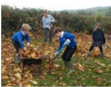
Our Eco Club has been tidying up the Discovery Area

and-daubing, doing an archaeology dig and tasting 'Roman' food. There are some fantastic Roman chariots to be seen in Bredy!